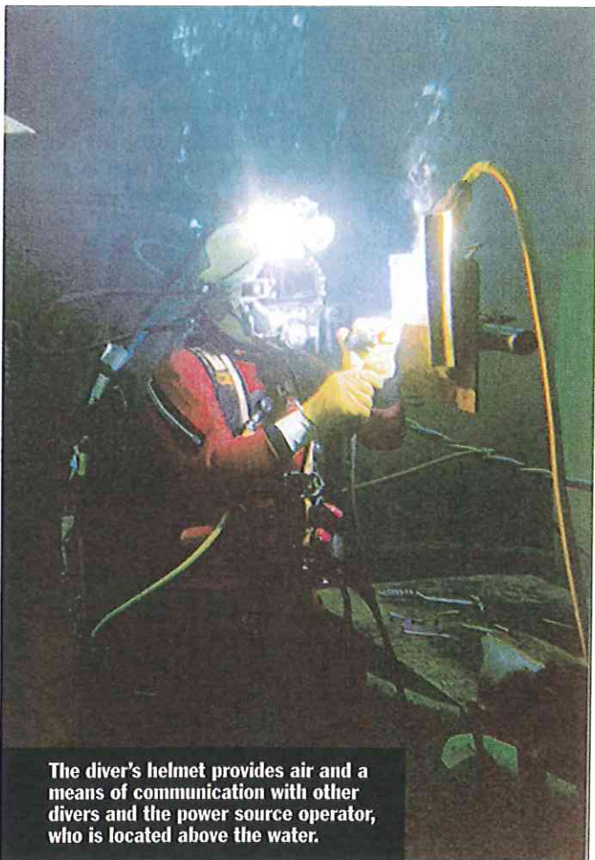
The diver's helmet provides air and a means of communication with other divers and the power source operator, who is located above the water.