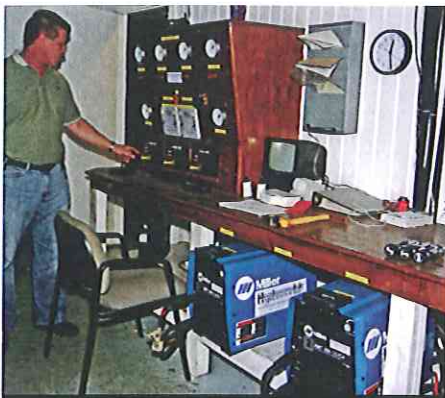
Miami Diver has found that the XMT 350 and XMT 456 multi-process inverters from Miller Electric Mfg. Co. provide portability and consistent weld quality.